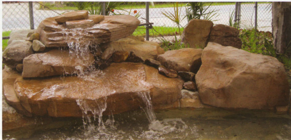
Boulder can be placed left or right side. 7 cast boulders, 8 natural cobbles per kit