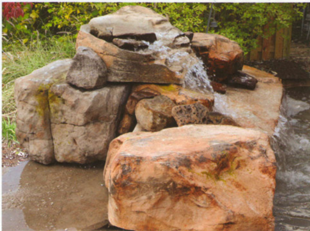
10 ft wide, 5 ft deep, 24 inches high finished boulders on all sides