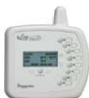
EasyTouch Wireless Controller