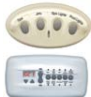
iS4 and iS10 Spa-side Remotes in choice of colors with varying cable lengths