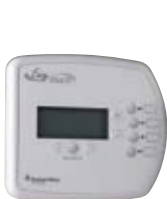
Indoor Control Panel (for 4 or 8 function control)