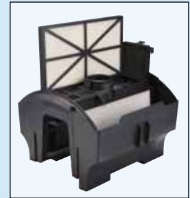
Filter removes easily from filter frame