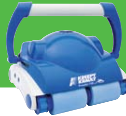
Kreepy Krauly® Prowler® 730 Robotic Pool Cleaner