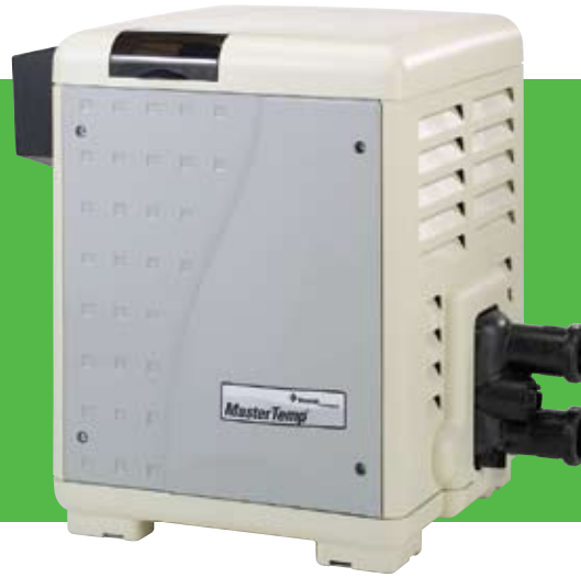
MasterTemp® High Performance Heaters

MasterTemp® high performance heaters offer best-in-class energy efficiency. Plus, they are certified for low NOx emissions, making them eco-friendly favorites.