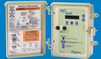
IntelliTouch® Indoor Control Panel