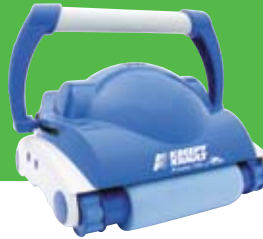
Kreepy Krauly® Prowler® 720 Robotic Pool Cleaner