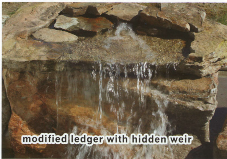
modified ledger with hidden weir

The ledger can be set back to spill on the base rock but seepage may occur unless all water is directed to the pool using good mortar joints and a pad sloping towards the pool. The base pieces must also overhang the pool forming a drip line.